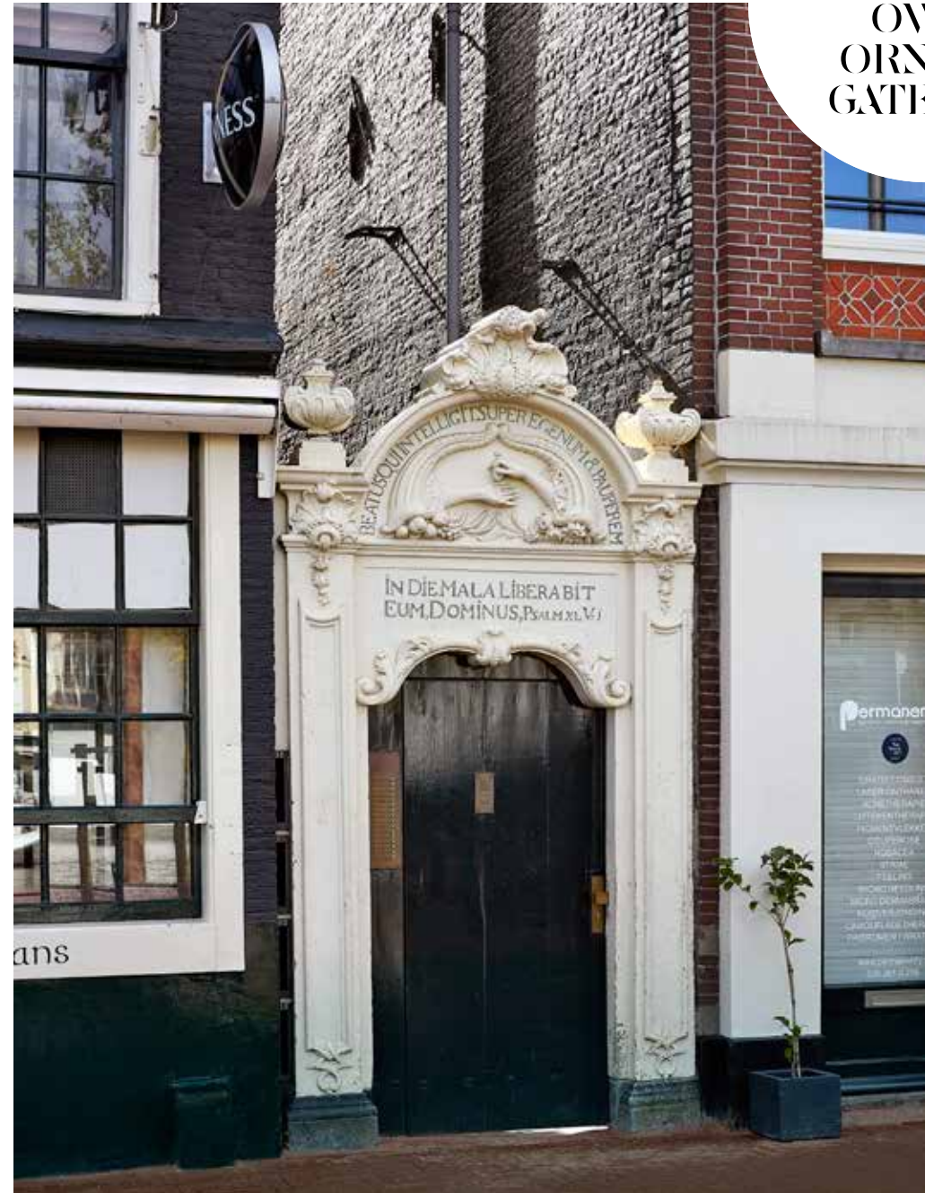
This page The entrance of the hidden chapel Page left Red velvet chair by Made, red and green pillows by Palais, other pillows from H&M Home