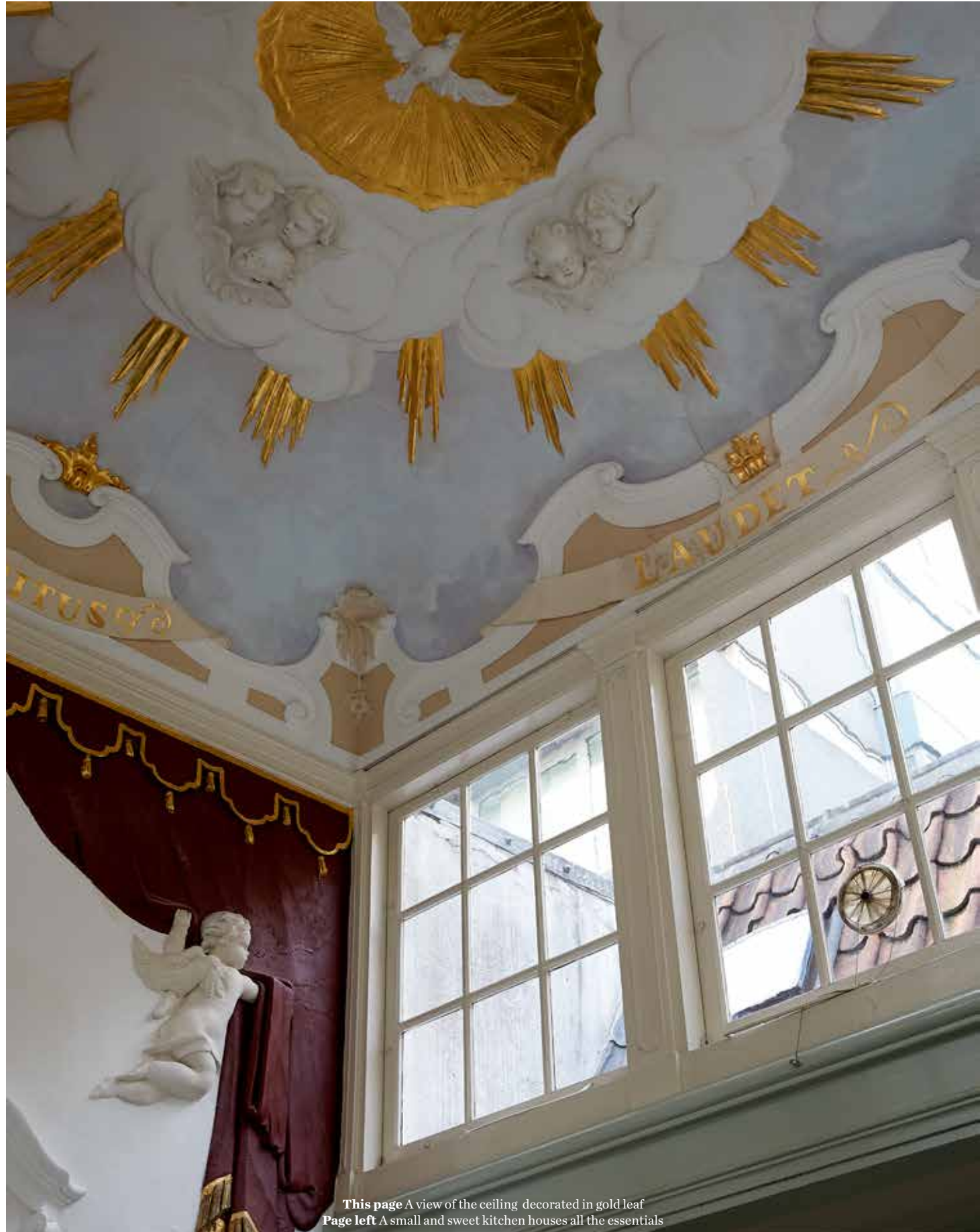
This page A view of the ceiling decorated in gold leaf Page left A small and sweet kitchen houses all the essentials