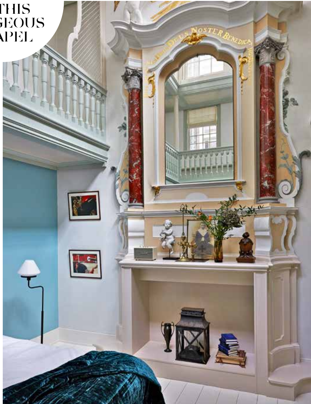
This page The old shrine where the vicar used to hold his sermons Page right The bathroom with a beautiful freestanding tub